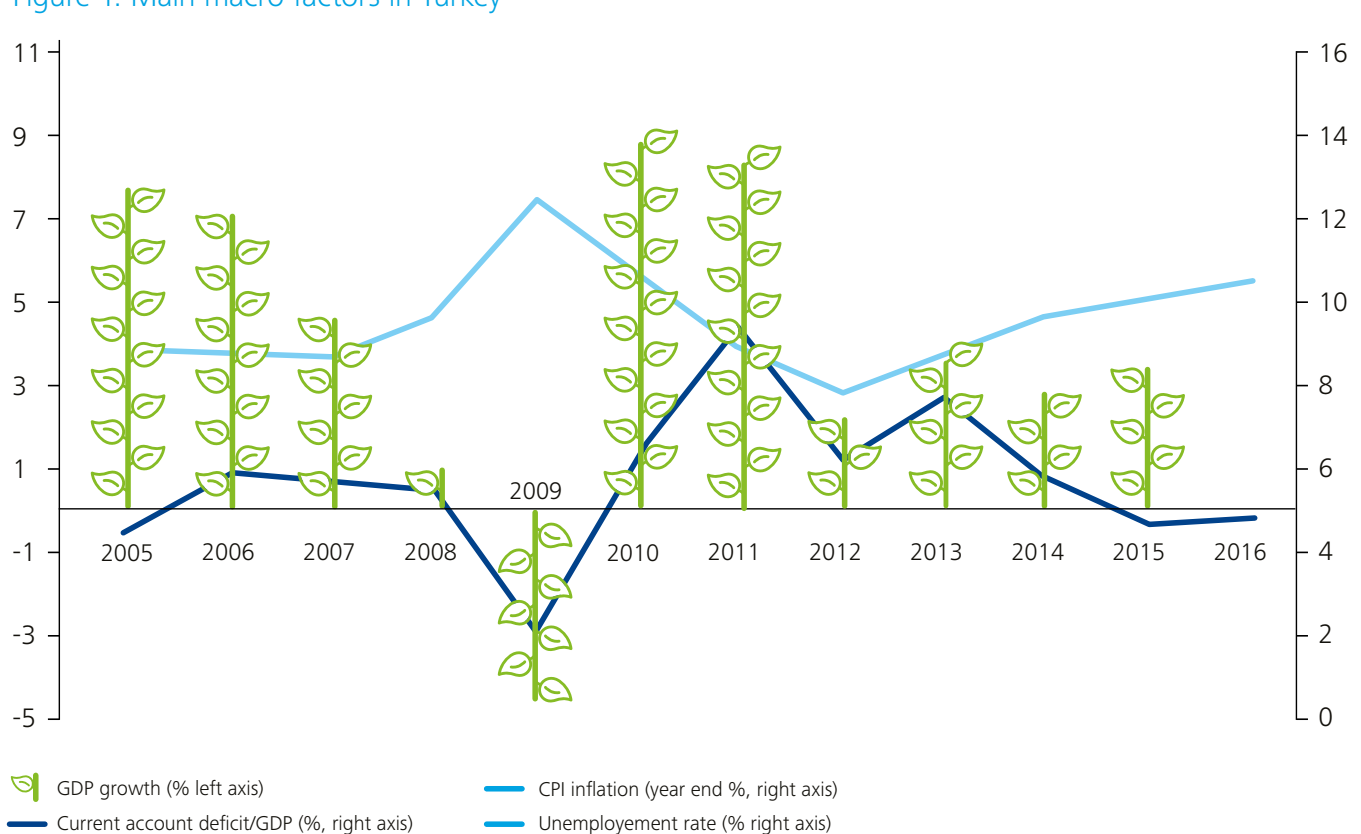
Figure 1: Main macro factors in Turkey

Apart from the unknown risks (termed black swans) and geopolitical risks, the main issues that should be monitored are FED, the course of China and other emerging economies including Turkey, and as well, the perceptions of investors regarding the emerging economies.