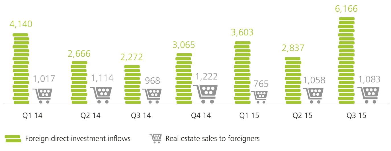
Figure 3: Foreign direct investments