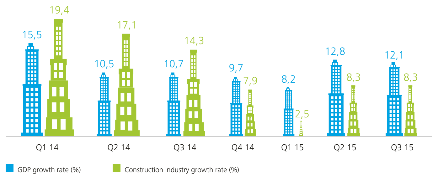
Figure 2: Construction industry vs. GDP growth rates (current prices)

The share of property sales to foreigners decreased by six percent in the first nine months of 2015 compared to the previous period.