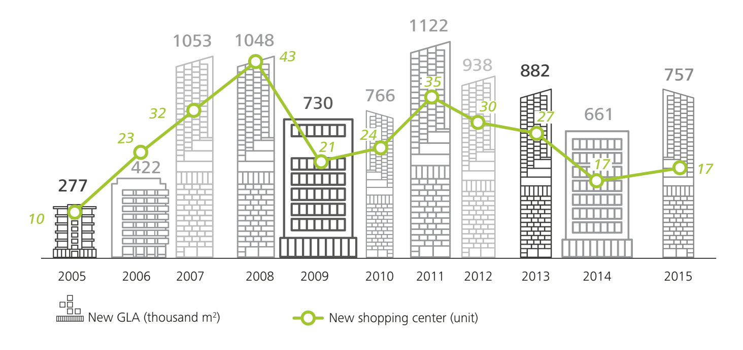
Figure 5: Shopping centers and Gross Leasable Area (GLA)

This ratio is still below the levels of most of the developed markets (EU-27 average was 265 in 2015), which indicates room for growth; currently there are 17 cities with more than one million people, in addition to the three main cities<sup>1</sup>. Thus, although the three large cities have reached a certain saturation level in terms of gross leasable area, there are many opportunities for growth in other cities across Turkey.